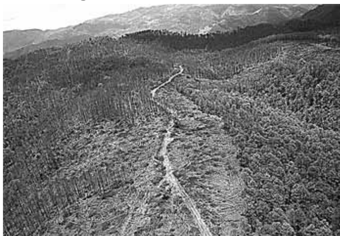
R. F. BILLINGS

Southern pine beetle infestation in Honduras controlled by cut-and-leave – a control method that creates a large fuel load which can lead to wildfires