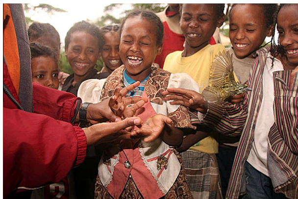
Fig. 1. Ethiopian primary school students releasing a banded Yellow-fronted Tinkerbird ( Pogonolus chrysoconus ) in Wondo Genet, Ethiopia.

In addition to the growing challenges of funding, the increasing difficulty and complexity of obtaining research permits is a growing problem not only for bird banding, but for biodiversity research in general. In fact, in many countries, if not most, it is easier and faster to get a permit to hunt birds than to study them (though some bird species are off-limits to hunting). In an age when young people are increasingly cut off from nature, when “nature deficit disorder” is a worldwide phenomenon (Louv, 2008), and when it is often faster to publish high impact papers by doing mathematical modeling, meta-analyses, reviews, and studies of existing datasets, we should not be increasing the bureaucratic hurdles for scientists and citizen scientists to do essential field work and to conduct biodiversity education and outreach. The growing bureaucracy of getting and renewing research permits can discourage professional and citizen scientists from undertaking bird banding and related field work, and can steer the career choices of young biologists away from field research to office-based research. The permitting agencies, wary about bad publicity, often yield to the demands of well-intentioned but emotional animal rights activists, whose philosophy is largely incompatible with science-based conservation and management of wildlife (The Wildlife Society, 2011). In fact, some activists oppose bird banding while continuing to